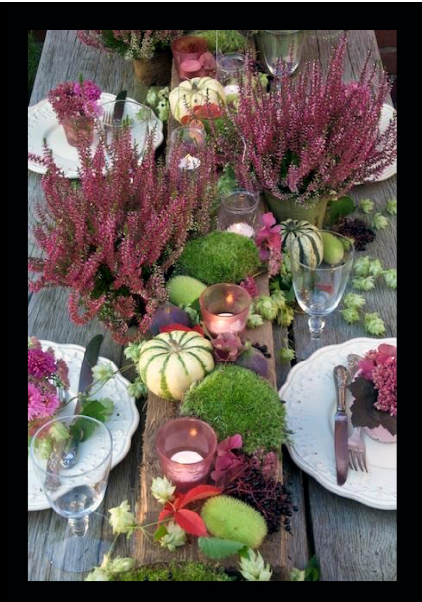
in everything give thanks